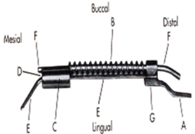
Fig 5 : a. Lokar Distalizer