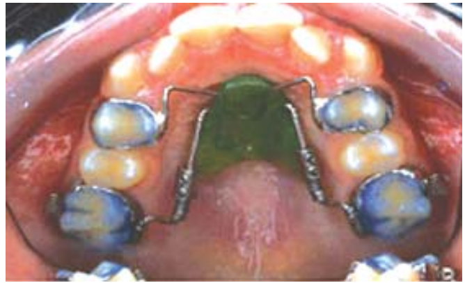
Fig 4: Distal jet appliance