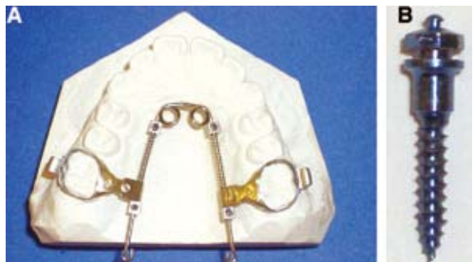
Fig 6: A, MISDS; B, the Aarhus miniscrew implant used with the MISDS.

In this method the molars are distalized with TPA made from TMA bars instead of stainless steel; the direction of insertion of TPA is made in a way that upon activation the arch applies a mesobuccal rotation to the anchor molars and a distally directed force to the opposite molar. 36 This TPA can be constructed by Lab