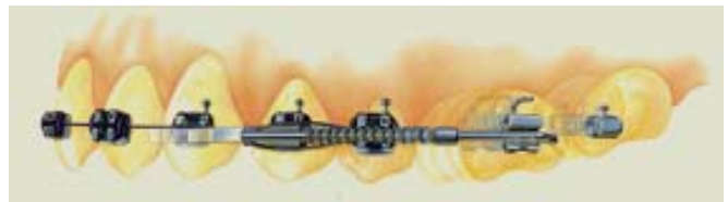
Fig 5 : b. Lokar Distalizer inserted to buccal segment.