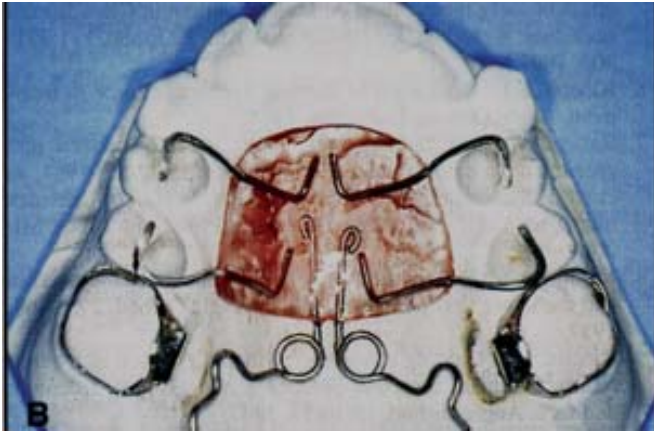
Fig 2: Pendulum appliance