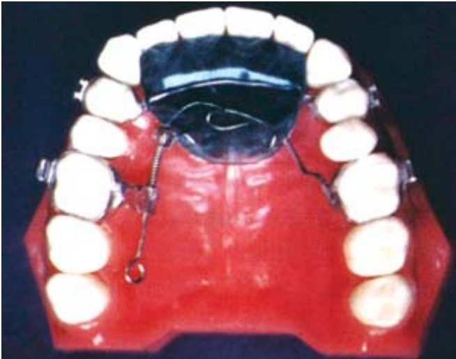
Fig 3: Keles slider