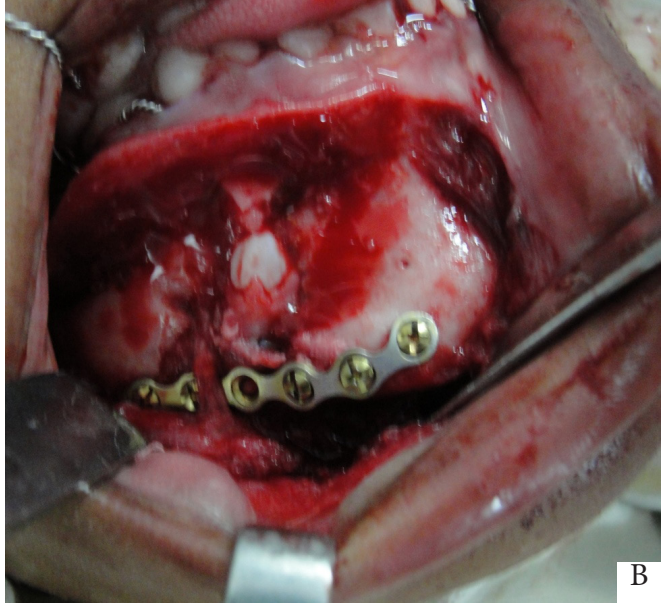
Fig. 1: A&B Panoramic Radiograph Showing Right Parasymphysis Fracture. Open Reduction and Internal Fixation of Right Parasymphysis Fracture