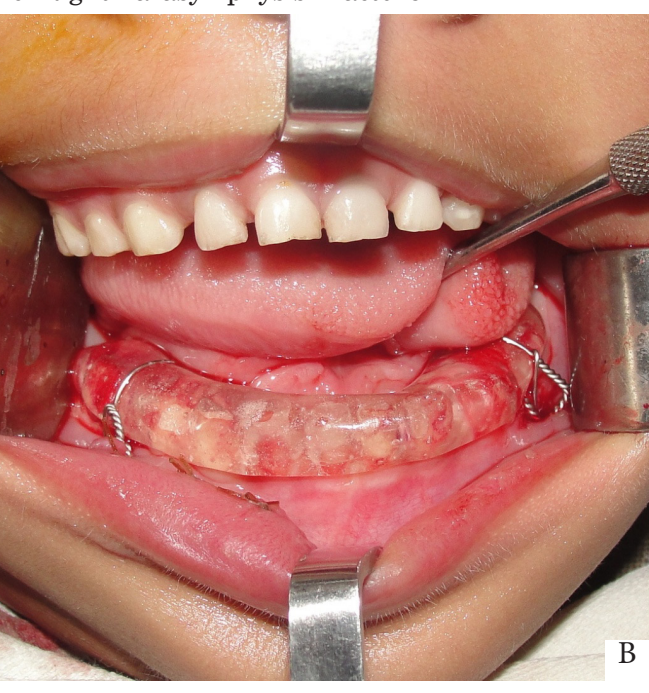
Fig. 2: A&B Panoramic Radiograph Showing Left Condylar Fracture. B. Acrylic Splint Fixation for Left Condylar Fractu